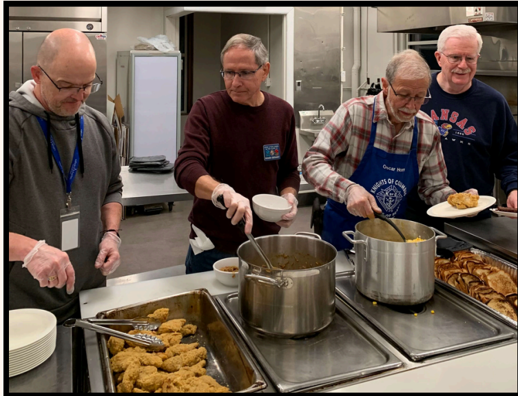
L to R

On January 23rd, some hearty souls from the council served another tasty dinner at Shalom House. Some seminarians came along to help serve the meal and wash dishes.